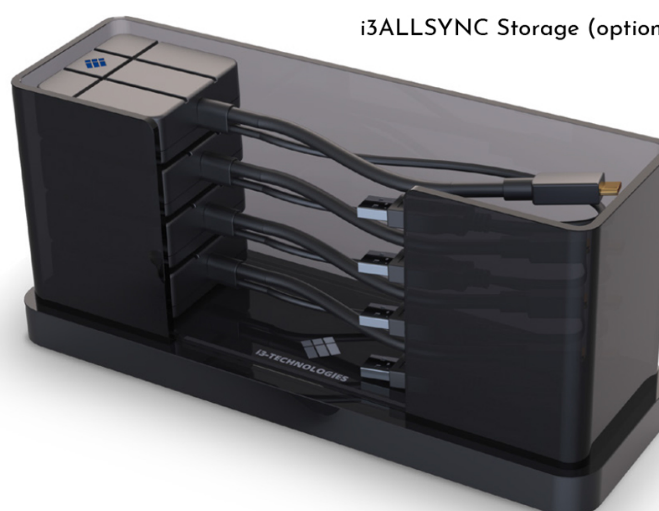
i3ALLSYNC Storage (optional accessory)